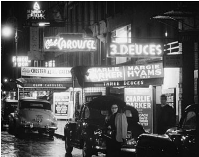
52nd Street, New York City in the 1940s. Photo by Wm. Gottlieb in public domain, library of congress

Reprinted from the Jim Cullum Riverwalk Jazz Collection at Stanford University