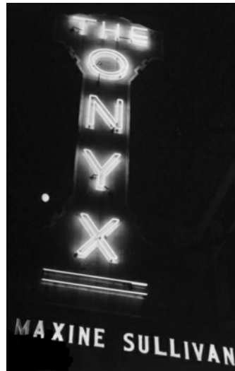
The Onyx Club.