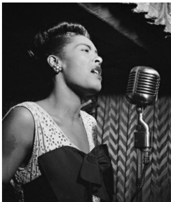
Billie Holiday.

The original title was “Flat Foot Floozie ” but Gaillard changed it to “Flat Foot Floogie ” to get it past the censors and have a shot at radio airplay. It worked— even though “floy floy” was a then-current slang for venereal disease. The lyric just sounded like a nonsense rhyme to the censors and many artists covered it. Benny Goodman had a number one hit with his recording, and when three records were selected to be memorialized in the Westinghouse time capsule—Benny Goodman’s recording of “Flat Foot Floogie ” was in the time lock, along with Finlandia by Jean Sibelius and “The Stars and Stripes Forever” by John Philip Sousa.