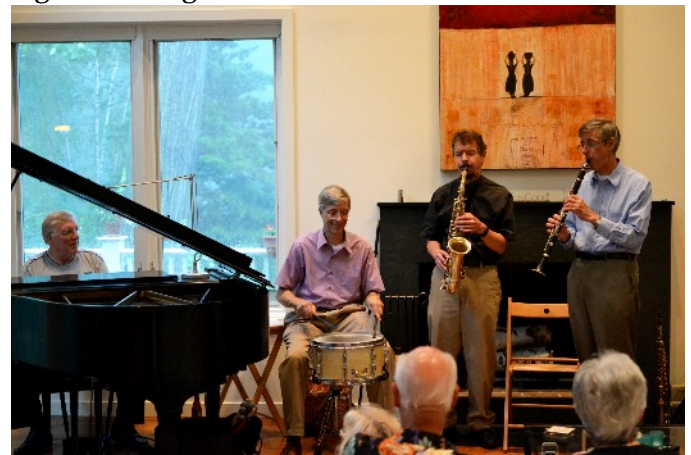
Sponsor & Patron Reception